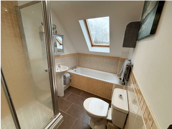
Shower cubicle, washbasin, bath and WC. Velux window, part tiled, tiled floor, extractor fan.