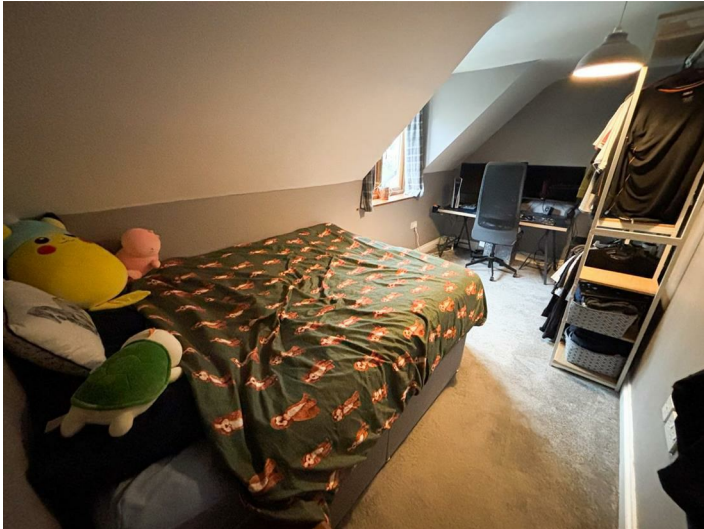
Window to side.